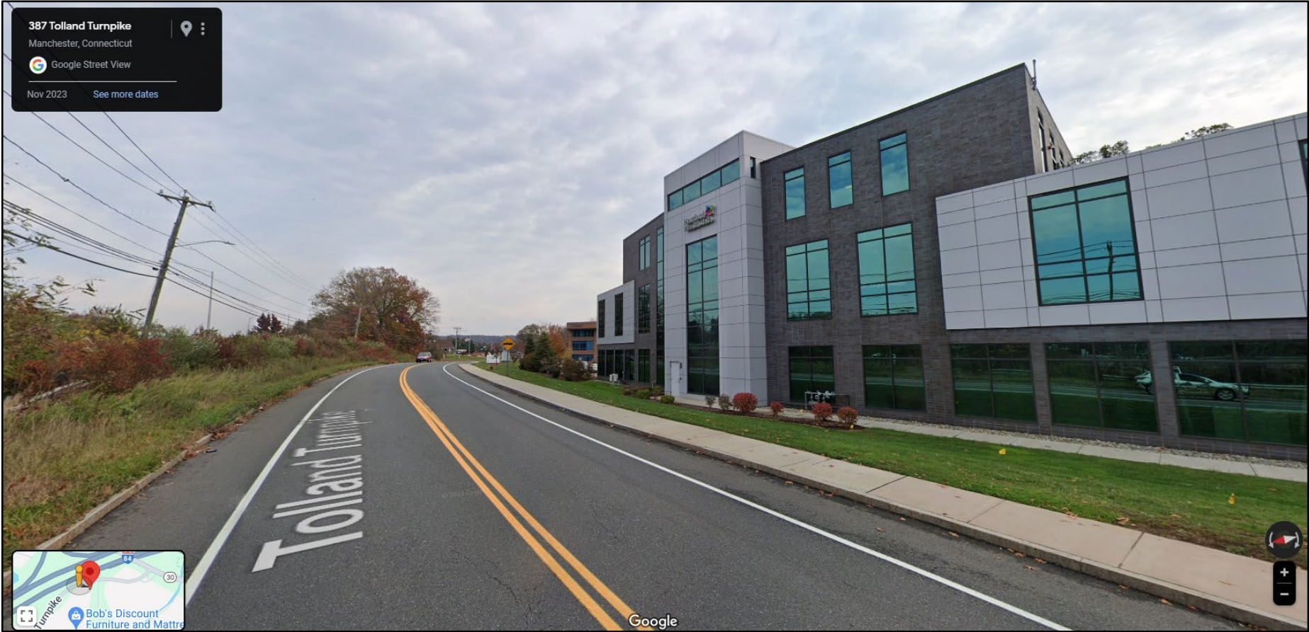
EXHIBIT A Street View from Tolland Turnpike