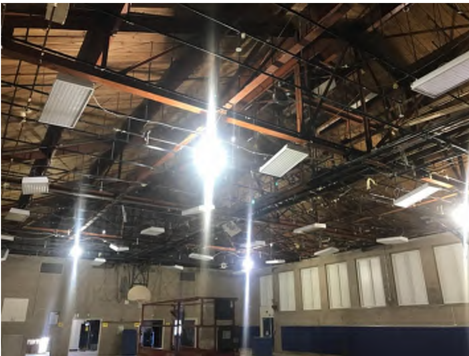
AAIS (demo) has started selective demo and abatement within the building. Ceiling removal with the gym has been completed.