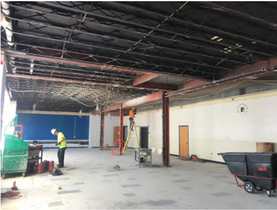
AAIS (demo) has started work in the existing classrooms.