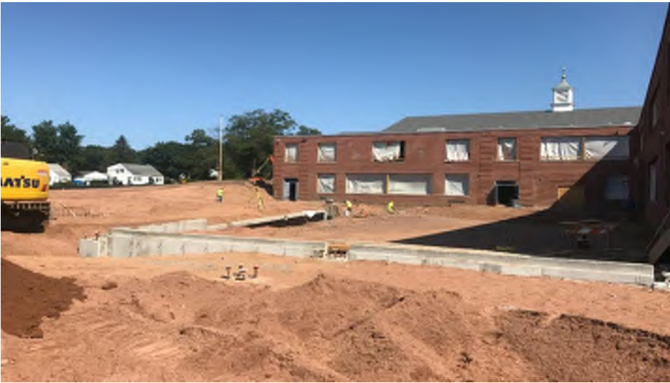
MT Ford (concrete) poured footings and foundation walls. Richard (sitework) has backfilled once damproofing was installed.