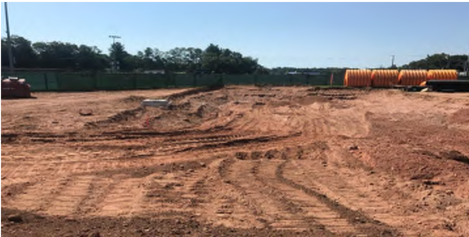
Richards (sitework) continues with new storm drainage and sewer.