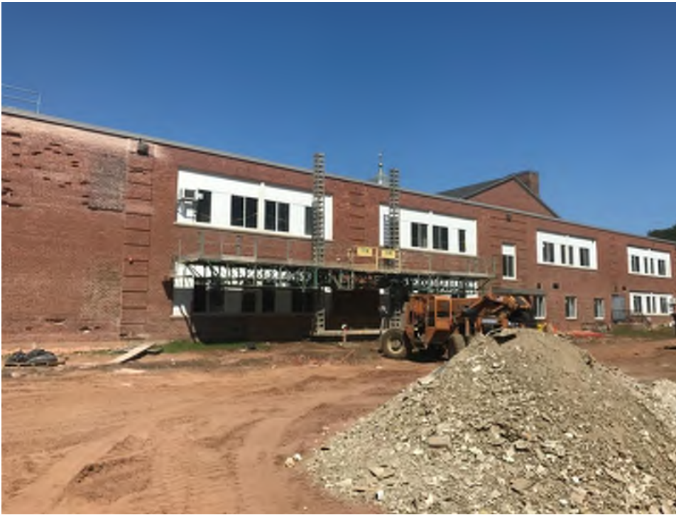
CT Mason (masonry) has started the brick cleaning and masonry reappointing.