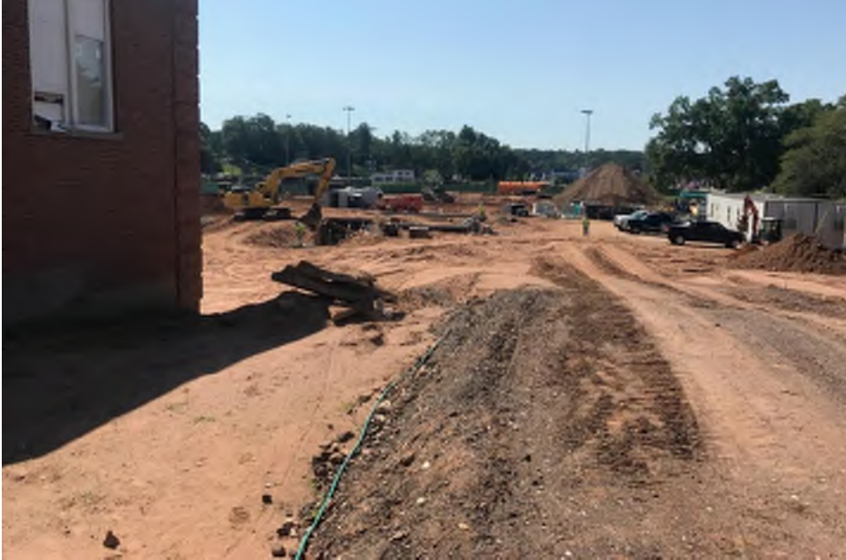
Richards (sitework) continuing with site demolitions and excavations.