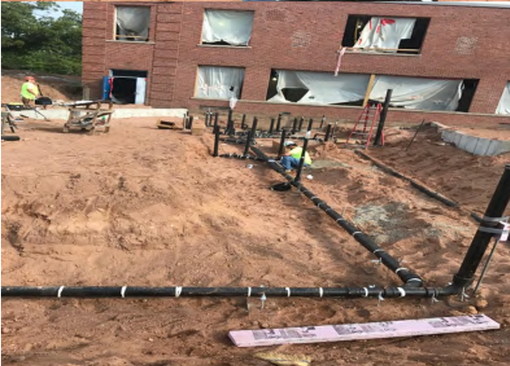
Underground plumbing work installed prior to slab pour at new building west. (continued)