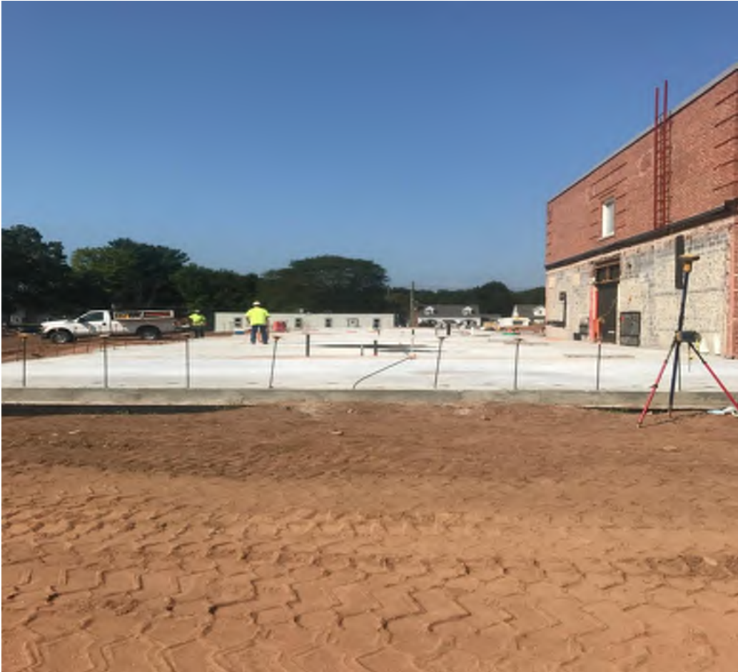
New building south slab installation and completion.