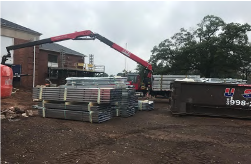
Metal framing delivery and unloading.