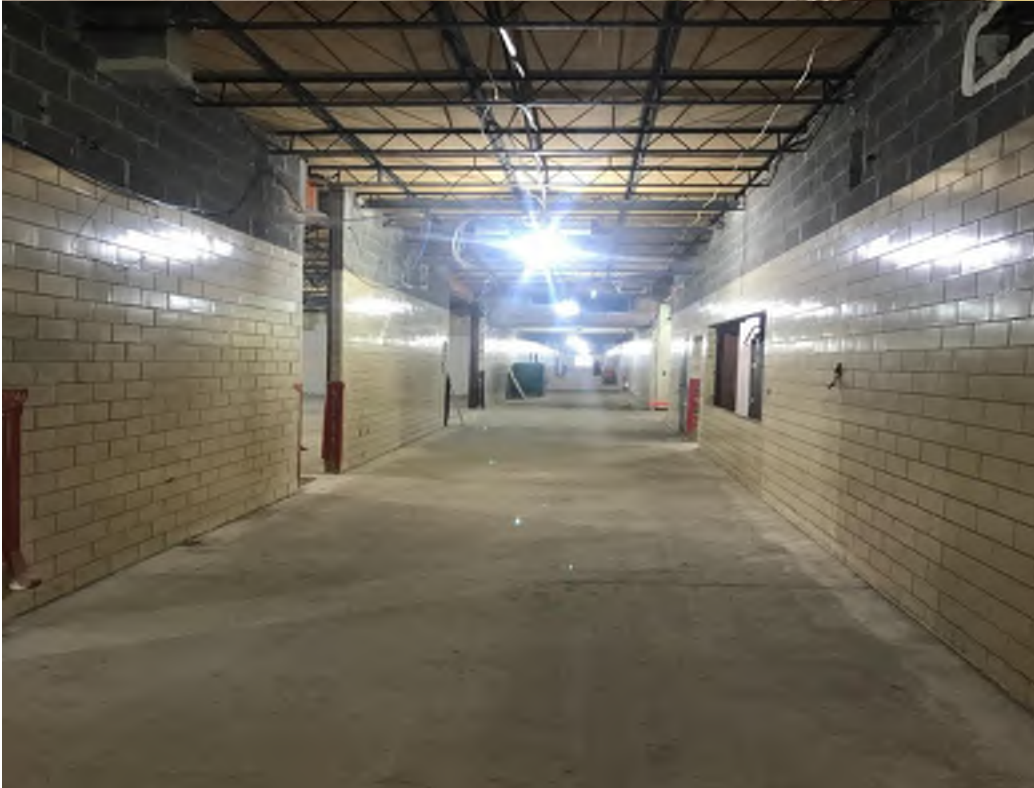
Demo and debris cleanout of a typical corridor within the existing building.