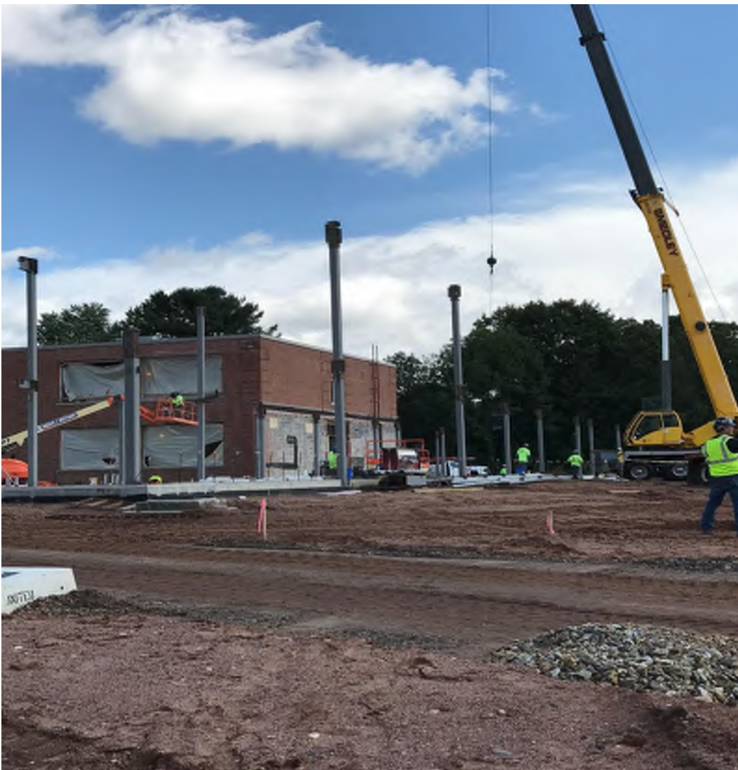
Erection of structural steel on new building south section.