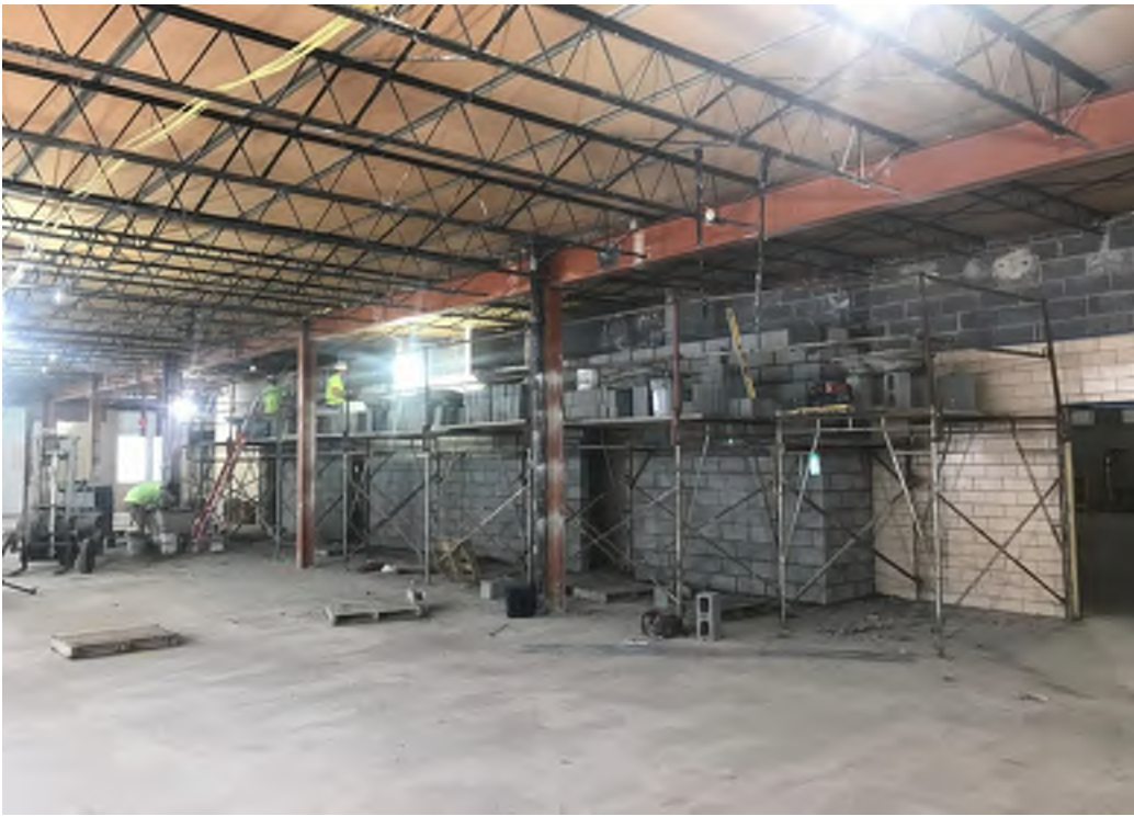
Interior masonry block work installations.