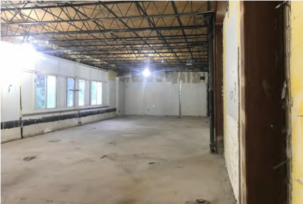
Demo completion and clean out of a typical existing classroom area.