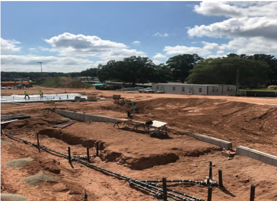
Site overview from 2 nd floor window.