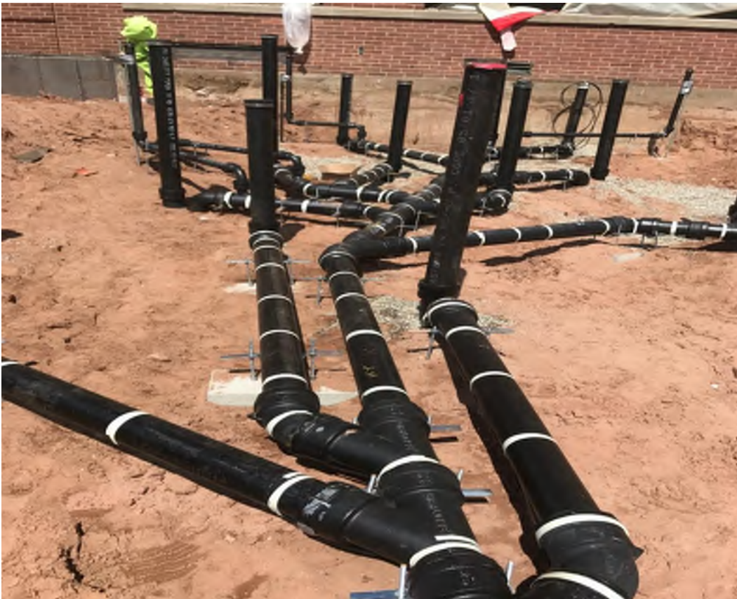
Underground plumbing work installed prior to slab pour at new building west.