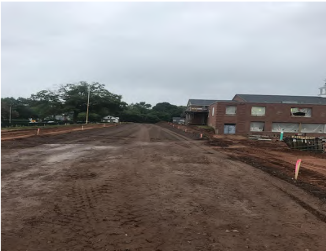
Sitework and grading